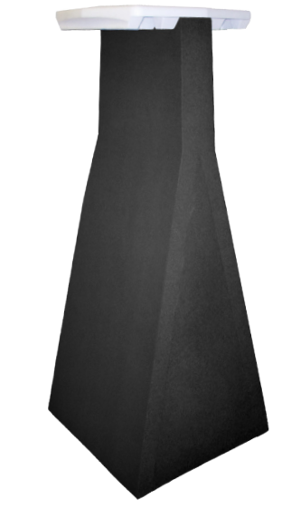
ETS-Lindgren's FS-1500H Anechoic Absorber